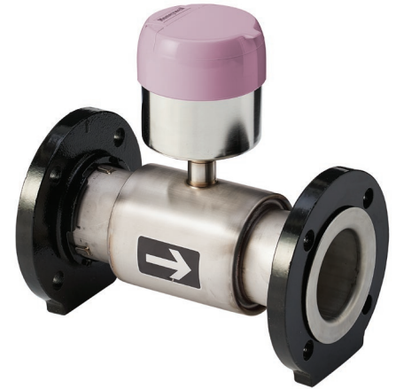
The evoQ 4 electromagnetic Meter RW is designed for 10 years of continuous operation with no battery changes necessary.